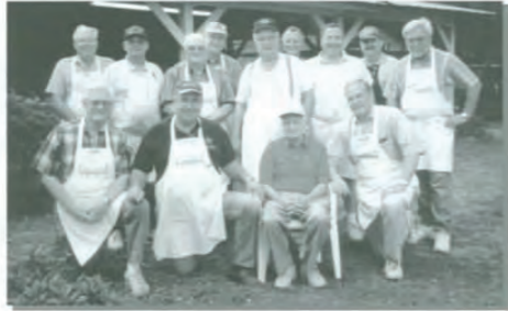
The cooks take a break to pose for the camera during the preparation for the Western day before the BBQ.